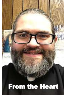
From the Heart