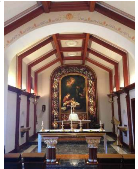
Chapel of Trumbull Manor

Oblates of Mary Immaculate, or the Jesuit Retreat House at Demontreville in Lake Elmo. In these group retreats a retreat master and preacher will give spiritual conferences to the group, and will make time to meet one on one with retreat goers so they can have direction in their spiritual life. Group retreats for laity are usually planned as weekend retreats beginning on Thursday night and continuing through Sunday midday. These retreats are held for men, women, or married couples at various times through the year. If you have never been on a spiritual retreat, one of the best things you can do for your spiritual life and your walk with God is to go on a retreat. By leaving the world for a few days, unplugging from technology and finding a place where the noise and busyness of life can be forgotten not only will you meet God in a more intense way and foster greater love for God you can also