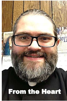
From the Heart