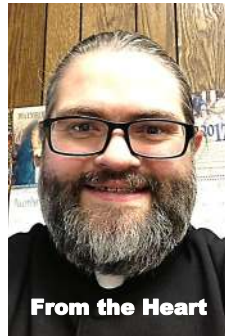
From the Heart