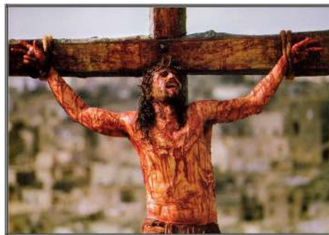
The Crucifixion in its True Horror