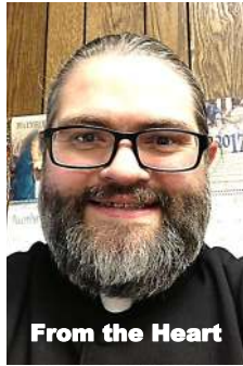
From the Heart