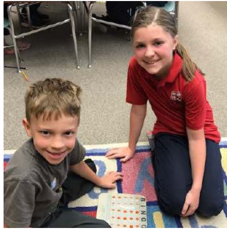
RAM Pride Bingo