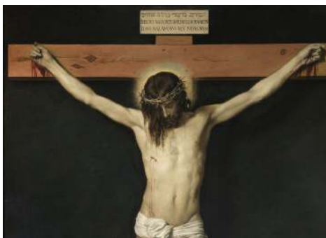
The Influence of the Resurrection