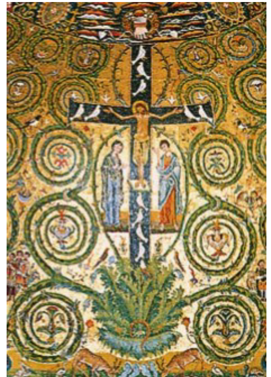
Apse Mosaic, San Clemente, Rome