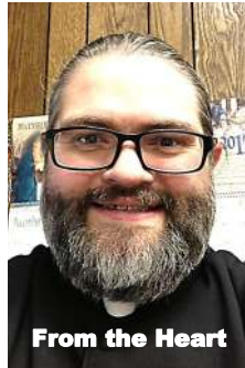
From the Heart

From the Pastor — written on September 12, 2017