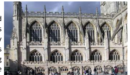
The Abbey of St. Peter & Paul, Bath, England

We should all be grateful that Archbishop Bernard Hebda is creating structures of support for priests and deacons that will serve them in their ministry and hence serve the entire flock. These supports and ongoing formation structures act like flying buttress that enables a Gothic Cathedral like Notre Dame in Chartres, or Notre Dame, Paris. The flying buttress supports the exterior walls in such a way that the building can reach even higher with those expansive kind of windows of stained glass that we have come to know and love in our Catholic Tradition.