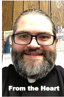
From the Heart

This final Sunday after Pentecost, and last Sunday before the start of Advent and the new liturgical year we celebrate The Solemnity of Our Lord Jesus Christ, King of the Universe . The sacred scriptures attest that Jesus is Lord, that Christ is King, in several places.