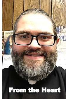
From the Heart

Even though academia, popular culture, and other contemporary actors have tried to supplant or replace Christian references and terminology through the use of terms such as B.C.E. (Before the Common Era) and C.E. (Common Era) nevertheless that something which radically changed the history of the world happened some 2018 years ago can not be denied. Jesus, the savior of Nations, Son of God and son of man, the Word made Flesh, Emmanuel, that is God-with-us, was born into the world, and the world has never been the same. "Christ is at the center, Christ is the center. Christ is the center of creation, Christ is the center of his people and Christ is the center of history." These words preached by Pope Francis back in 2013 echo this foundational principle.