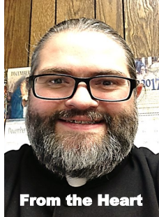
From the Heart

"Sacred Heart Catholic Parish exists to foster a community of disciples in response to the Gospel of Jesus Christ through Worship, Fellowship, Catholic Education and Service"