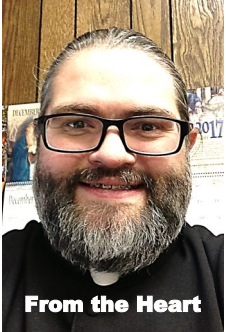
From the Heart

"Sacred Heart Catholic Parish exists to foster a community of disciples in response to the Gospel of Jesus Christ through Worship, Fellowship, Catholic Education and Service"