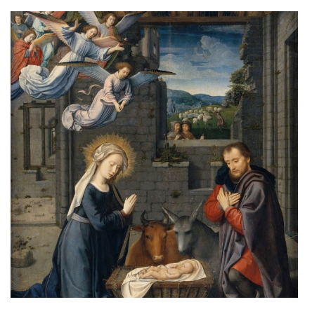
Christmas Mass Schedule *** Holy Day of Obligation ***

3:15 PM – Enjoy special Christmas hymns, carols, & music provided by The Hand Bell Ensemble, and Choristers.