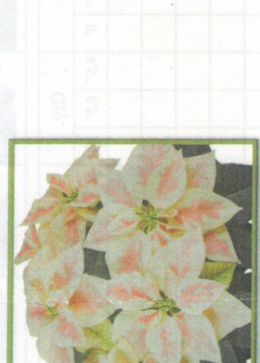
Cream colored flower with a pink center Marble