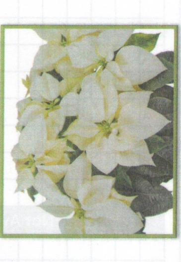
Classic white poinsettia White