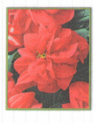
Winter Rose Red Curly red flower