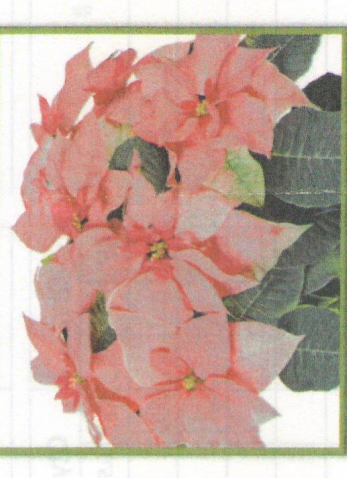
Classic pink poinsettia Pink