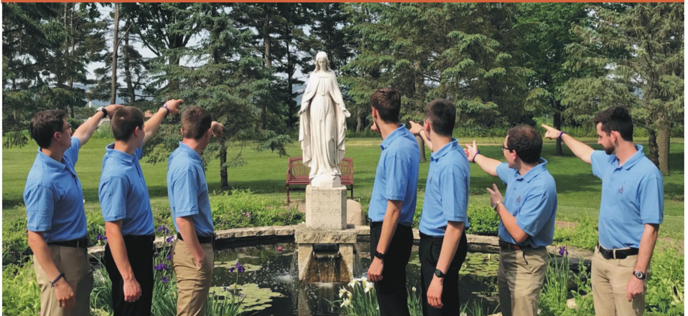
TOTUS TUUS...TOTALLY YOURS THROUGH MARY!

Bring the good news to the next generation; share the faith, build friendships, answer the call and become a 2022 Totus Tuus Summer Missionary in the Archdiocese of Saint Paul and Minneapolis!