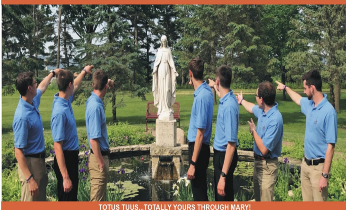
TOTUS TUUS...TOTALLY YOURS THROUGH MARY!

Bring the good news to the next generation; share the faith, build friendships, answer the call and become a 2022 Totus Tuus Summer Missionary in the Archdiocese of Saint Paul and Minneapolis!