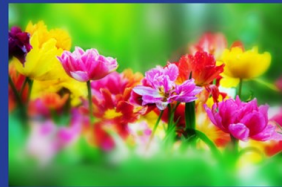
Gertens Plant Sale

Did you order plants this year? You may pick up your plant order on May 5, from 1:00 – 5:30 pm, in the Broadway Ave parking lot.