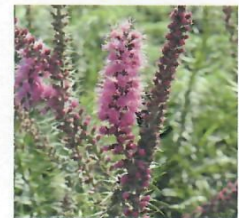
Liatris Prairie Blazing Star

Many more plants and flowers available online!