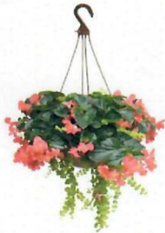
13" Begonia Viking Explorer