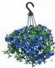
12" Petunia Night Sky