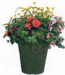
13" "The Mini" Sun Combo