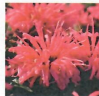
Monarda Sugarbuzz Bubblegum Blast