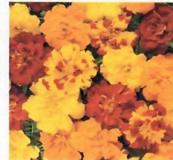
Marigold Durango Mix