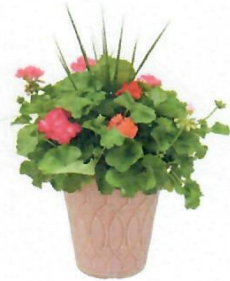
13" Geranium Mix w/ Spike