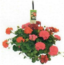
12.5" Geranium Zonal Mix