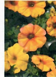
Petunia Supercal Sunset Orange